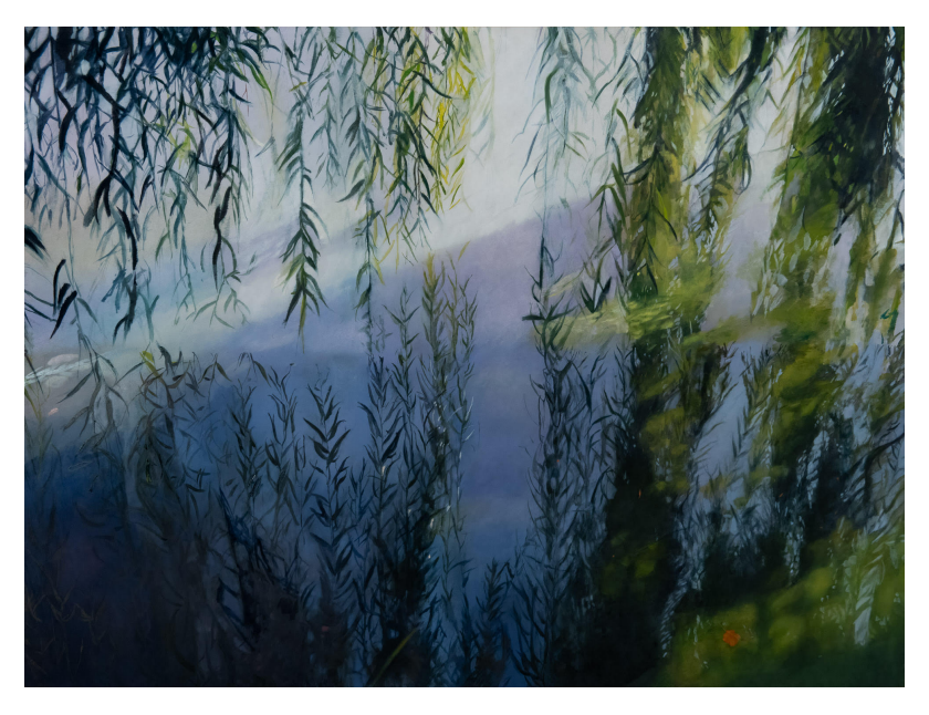
Emma Tapley, After Life/Central Park, 2024, oil on panel, 36 x 48 in.

DFN Projects, 16 East 79 Street, garden level, New York, NY 10075 Opening reception: Wednesday, May 1, 5-7pm Gallery hours: Mon - Fri. 11-4pm