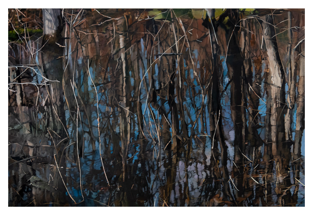
Emma Tapley, After Life/Inversion, 2024, oil on linen, 40 x 60 in.

Tapley's dizzying new paintings are gleeful acts of deception and subtle commentary on the notion of farce inherent in painting. Ranging from dutiful translations of trees, skies, and flora, to impressionistic renderings of forests, they take the tenets of landscape and turn them on their head. Tapley obfuscates or eliminates horizon lines, crops out canopies and root systems, and makes porous the boundaries between foreground, midground, and background. Without these anchors, literal tethers to the terrestrial plane, Tapley's landscapes transcend the space of reality. Tapley allows the paintings to expose themselves as paintings, peeling back the pretense of representation to show the tricks and techniques that go into recreating reality. This quality of self-awareness adds to the levity of Tapley's paintings, permitting them to wink as they toy with the fabric of reality.